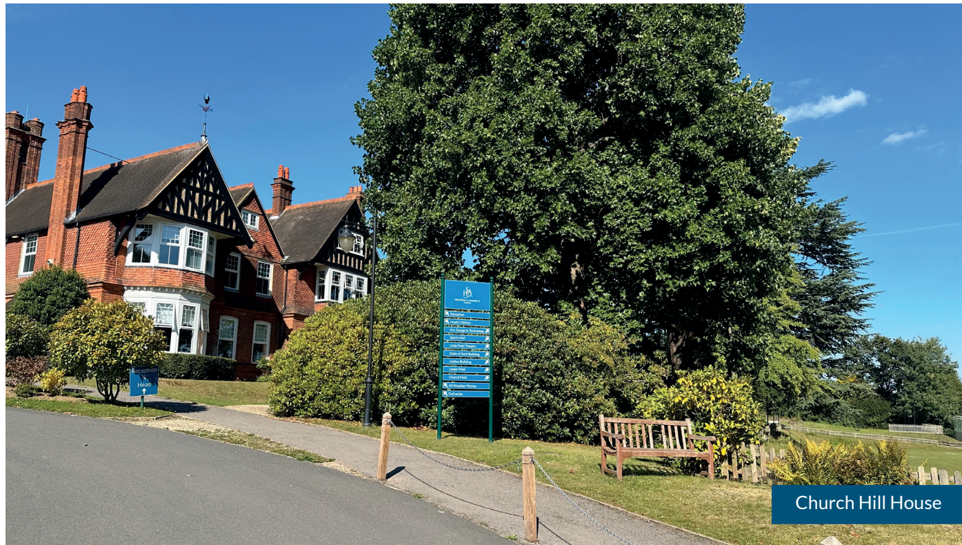
Church Hill House